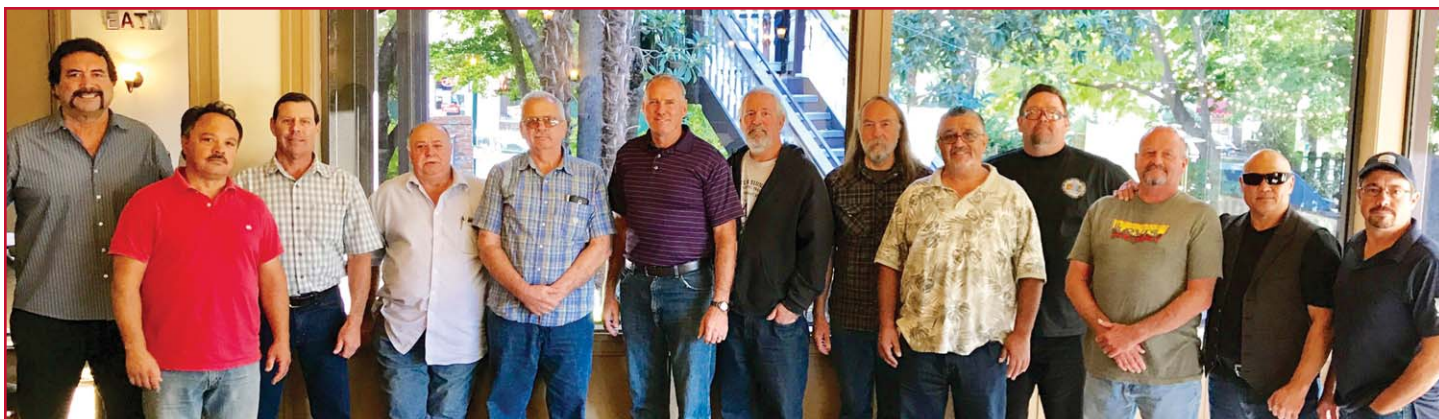
BAC Local 3 Executive Committee